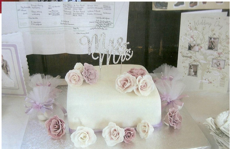
The wedding cake

Side by side with Christ your Saviour, may you daily walk with him